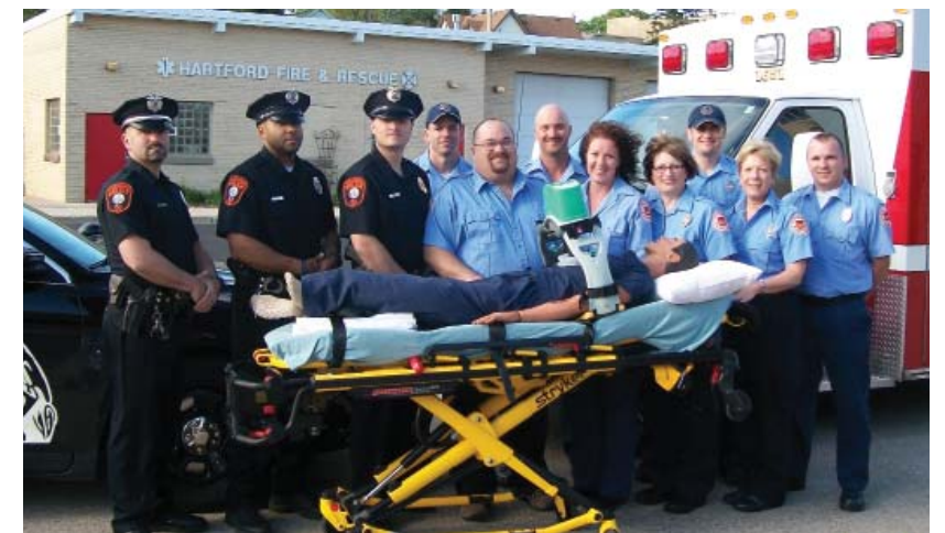
Hartford Police and Emergency Medical Services with their new CPR device.