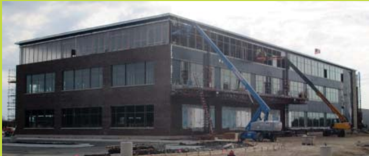
The new Aurora Cancer Care center is part of a larger Aurora Health Center being built near Spring Valley Road and Highway 36.

Hope is getting a new home in the form of a brand new state-of-the-art cancer center in western Racine and Walworth Counties. Aurora Health Care Foundation's Partners in Cancer Care campaign was officially launched in January of 2015. It's a two year, $2.2 million community fundraising effort to expand patient services at the new cancer center. In less than a year, over $1.6 million has already been raised! What helped jump start the campaign was a $1 million gift earlier this year from the Memorial Hospital of Burlington Community Foundation.