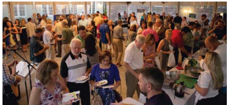
Donors of the Live Well Ozaukee event in August contributed $45,000 toward the When Minutes Matter campaign.